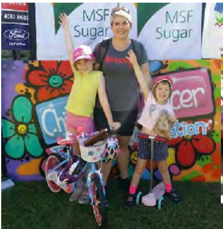
Lions Club of Mareeba (Q2) Mareeba Lions held their annual Metrogaine and donated $5,000 to the Foundation -