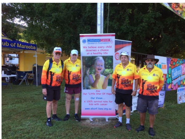
One of the participating teams

The Express Newspaper 22nd June 2022 Published on Jun 21, 2022