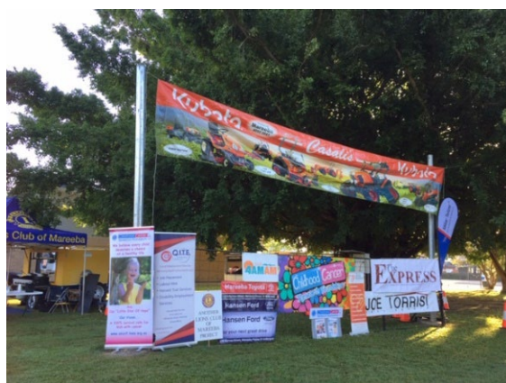
Setting up for the day